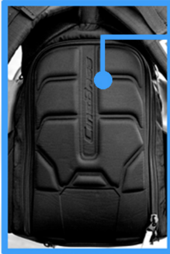
3D padded backpanel