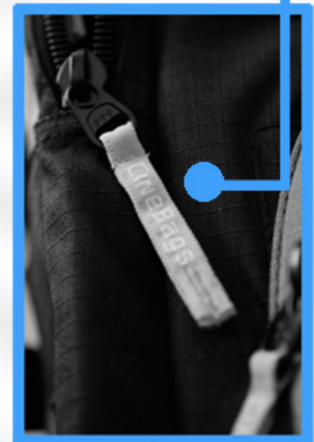
padded hip belt