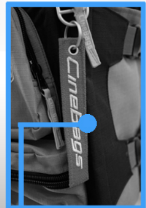
CineBags Key Chain